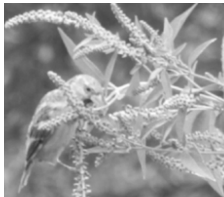
House Sparrow eating ragweed

If you are interested in learning more about birding in Central Texas, consider attending Travis Audubon Society meetings (see www.trisaudubon.org for more information), or join the Wells Branch birders on Monday Sept. 30 at 7:30am at Mills Pond. Bring your binoculars or if you do not have any, we can share extras we have amongst our hosting teams.... Watch www.wbna.us for more scheduled bird walks this fall and winter.