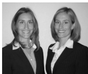
(Residents of Wells Branch)