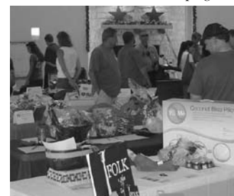
Hundreds of people perused the Silent Auction.