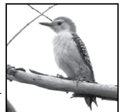
*Bird is Red-bellied Woodpecker