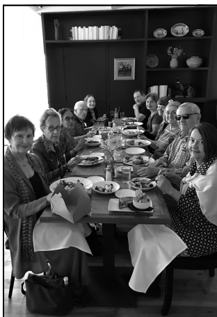
The Stagecoach Inn in Salado

The Silver Branchers would like to extend an invitation to any and everyone who might be interested in making new friends. Meetings are held Thursdays of each month from 1-3pm at the WB Rec. Center, 3000 Shoreline Drive to visit and play games. We also have socials and take day trips to local places of interest from time-to-time. Membership is free. There are no age requirements; everyone is welcome. Both individuals & couples are invited. For more information, call 512-461-1665 or just stop by.