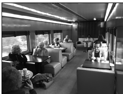
Silver Branchers on the Hill Country Flyer