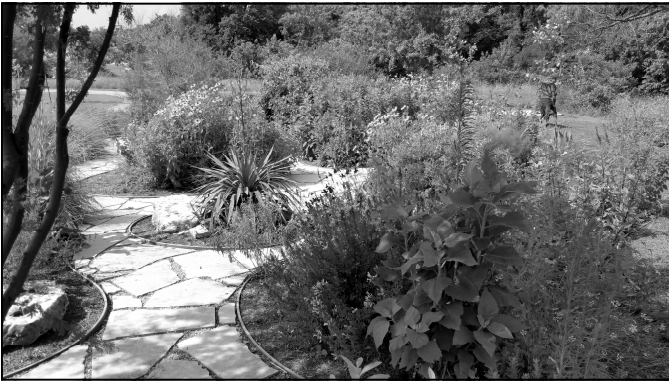
Be sure and check out the plantings in the WB Butterfly Garden.

I wanted to share this observation in case any gardeners are researching what to plant this year. Normally, it is not this noticeable to me. It is a nice feeling to be able to help restock our pollinators' resources in contrast to what is being wiped out to development all around us. Most of these plants are perennial, and once established do not require much work at all. Happy gardening/pollinating!