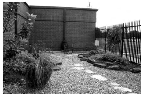
The Patel Memorial Garden at WB Elementary

Our annual gala is scheduled for October 22 nd . It is held this year at the Norris Conference center on Anderson Lane in Austin. A large silent auction will begin at 5:30pm followed by dinner and a brief program at 7:00pm. Please call our office for more information. 512-248-2547. Everyone is welcome and encouraged to come and learn more about Concordia High School.