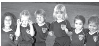
Get your game faces on!