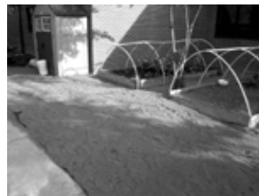
Numerous volunteers spent weeks readying the gardens and spreading crushed granite to prepare for the students and the fall growing season.

FARMERS MARKET: We have many plants in and hope to open in October with our organic produce. Watch for emails and FB posts.