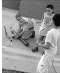
Rocket launch demonstration at the Join Scouting Night event.

Each school year, we look forward to welcoming new Cubs to the Pack. Our Pack and Dens meet several times each month and boys receive a free uniform upon joining Pack 140. Youth may join any Boy Scouts of America Cub Scout Pack in the neighborhood regardless of grade school affiliation. If you are interested in having your son in a great neighborhood program please visit our website at www.pack140.org for a link to request more information. Also visit Scouting.org to learn more about Scouting in America and how it helps to build our youth to be strong citizens and leaders.